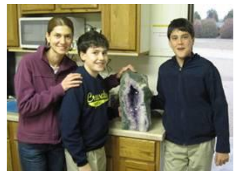
2011 Grand Prize Winner

Please visit us at the shop or our table at Brookhaven in February.