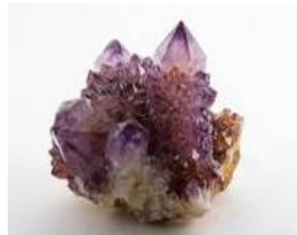
Quartz variety Amethyst from South Africa

This gemstone was believed by ancient Greeks and Romans to ward off the intoxicating powers of Bacchus, also is said to keep the wearer clear-headed and quick-witted. Throughout history, the gemstone has been associated with many myths, legends, religions, and numerous cultures. English regalia were even decorated with amethysts during the Middle Ages to symbolize royalty. It has been associated with many myths, legends, religions, and numerous cultures. Amethyst is purple quartz, a beautiful blend of violet and red that can be found in every corner of the earth. Historically, the finest amethysts were found in Russia and were featured in much royal European jewelry. Today, while Brazil is the primary source of this gemstone, fine material can be found elsewhere, especially in Zambia.